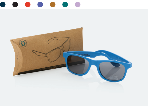
GRS-certified recycled PP plastic sunglasses