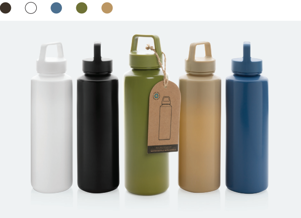
GRS-certified recycled PP water bottle with handle