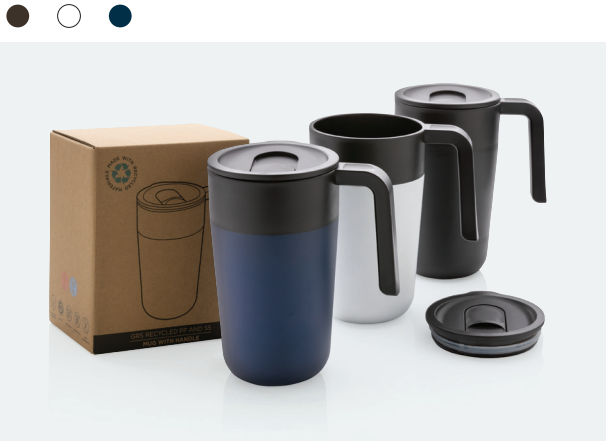
GRS-certified recycled PP SS mug with handle