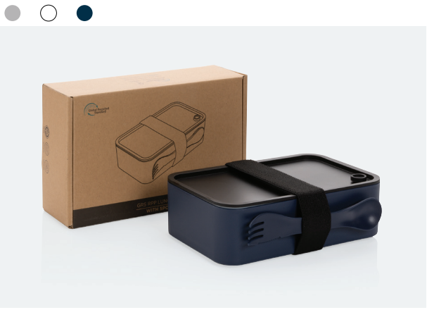
GRS-certified recycled PP lunch box with spork